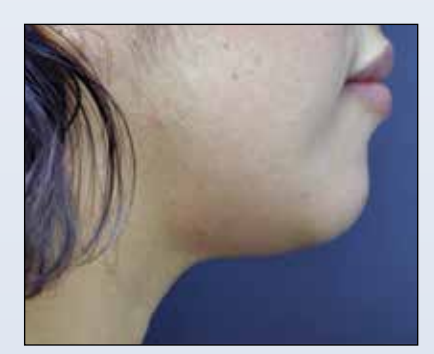
After two Exilis Ultra Tight treatments