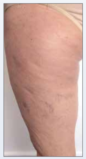
After four Exilis Ultra Smooth treatments