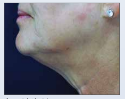
After two Exilis Ultra Tight treatments